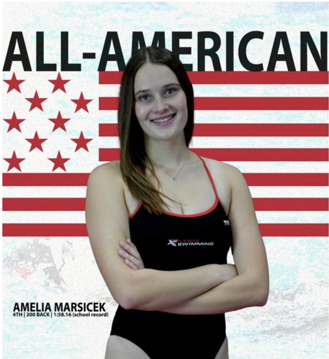
Scenes from Flyer Athletics